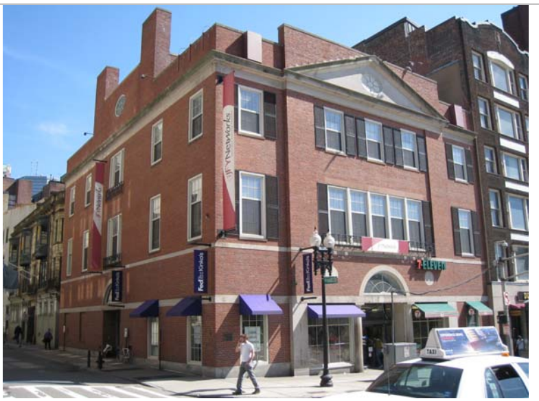
Tremont Street Facade