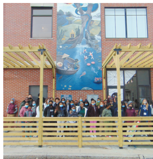
Group photo in front of Phở Hòa.

But the true heroes of this project are the students themselves. They join us as neighbors in Boston as Boston locals and from countries scattered across the globe including Afghanistan, the Dominican Republic, Ethiopia, Guatemala, Vietnam, and many more. During a pandemic, nonetheless. These are stories written by students from the ESL 1 newcomers and the 6th-grade inclusion program who learn best in non-traditional classrooms or are in classes designed for New Language Learners. They have overcome many challenges in the world to pen these stories about Boston, their new home.