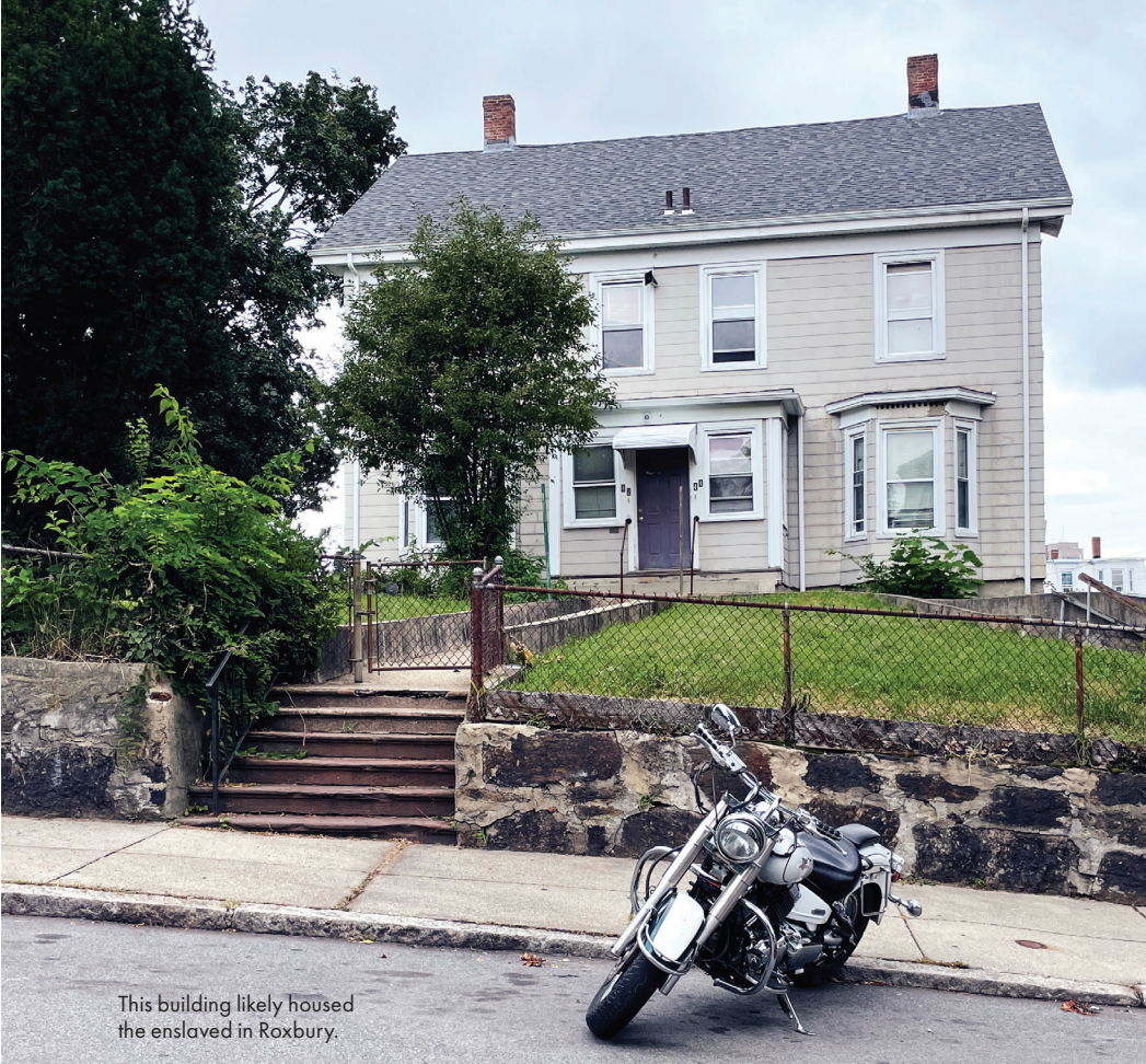
This building likely housed the enslaved in Roxbury.

The Alliance and its devoted supporters have worked hard advocating for Boston and will continue to work towards improved development policies. It's time to broaden the definition of preservation, make room at the table for more voices and experiences, make changes to our processes and policies, and to broaden our efforts to collaborate with advocates in affordable housing, climate preparedness, and equity and inclusion to write the next chapter in the story of this beautiful, vibrant, old city.