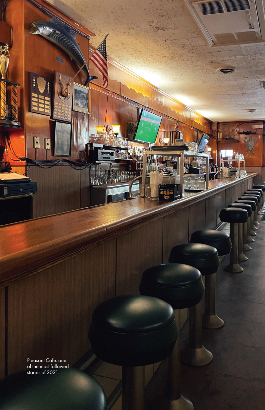
Pleasant Cafe: one of the most followed stories of 2021.