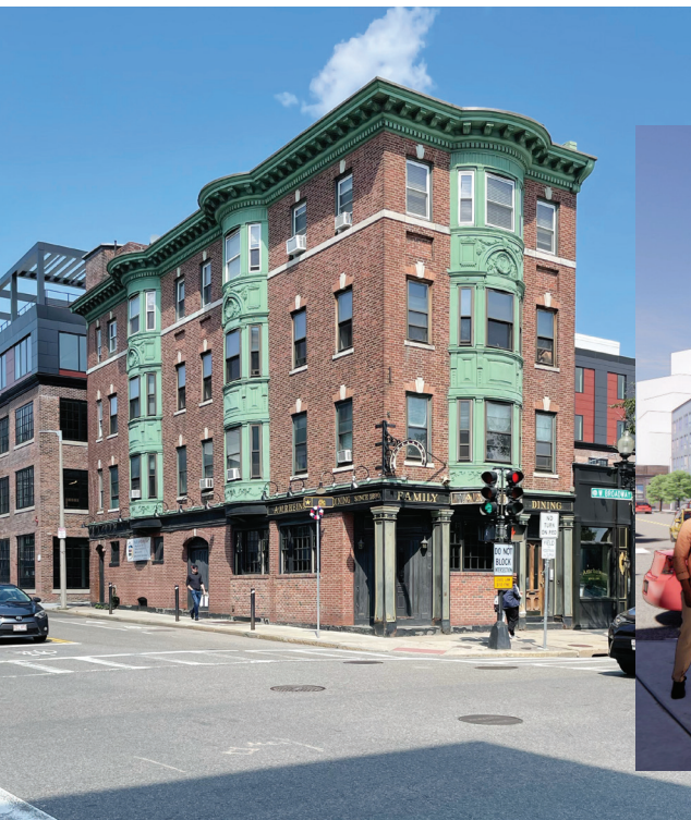
Left: Amrheins in 2021 Below: Project as approved

In a city like Boston where history is part of its core identity and a major driver of its economy, it may come as a surprise that there is no capital funding in the City's budget for historic preservation. Other than a portion of limited funds from the Community Preservation Act, there are frustratingly few resources for historic property owners to turn to for support. Boston has lost many valuable resources because funds were not available for maintenance, preservation, and restoration. The Alliance saw a need and we worked with partners at Hemenway & Barnes to establish a new fund for historic preservation called the Legacy Fund for Boston. Eventually, we hope that all development projects in the city will be required to commit meaningful sums to the fund, but as it gets started the critical contributions are voluntary. The first major contribution to the fund is expected to materialize in the spring of 2022 and the fund's committee will launch the first round of grant opportunities to the public. Funds will be made available to preservation projects across the city. We anticipate this fund will not only provide much-needed financial support for stewards of our city's historic resources, but will also serve as a model for other cities with similar gaps in support.