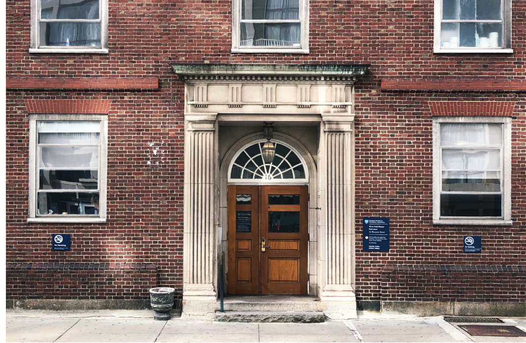
The historic West End House, one of three West End buildings to be demolished.

Many Boston communities are facing significant changes through demolition and insensitive new construction, and residents don't always agree about what's best for their neighborhood. When a developer purchased the iconic corner building that's home to Amrheins, the oldest bar and restaurant in South Boston, the initial proposal was to save the building and add an addition. But some residents felt that the addition was too tall and the compromise was to take down Amrheins and lower the whole project. The Alliance advocated strongly, with much support from the community, elected officials, and staff at the BPDA, to keep the beautiful, historic structure that holds memories for so many generations. After many discussions, the end result is a facade project that will preserve and restore the two outer facades and construct a life sciences building behind the walls. While facade projects are never ideal, we do think they can be done successfully and we hope that this solution will help South Boston residents connect with their neighborhood and its history in a meaningful way.