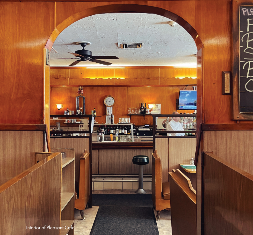
Interior of Pleasant Cafe

to empower Bostonians from Eastie to Mattapan to advocate for a sense of place in their communities.