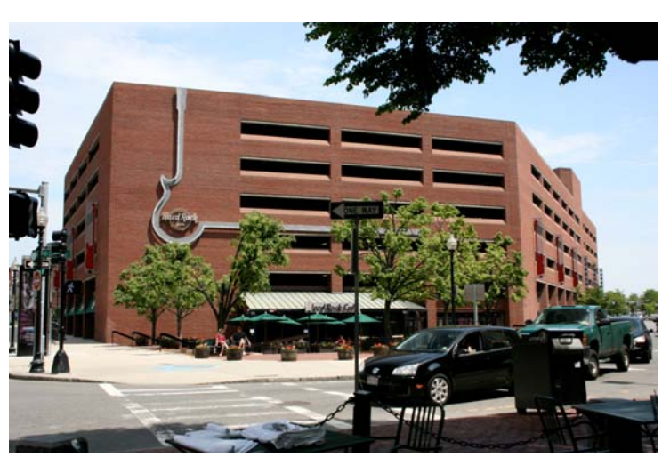
North, west, and south facades (North and Clinton streets)