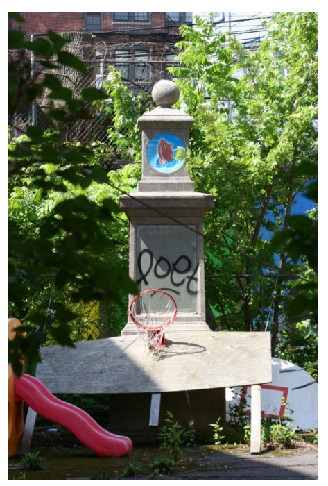
Figure 18. Courtyard monument. May 2022.