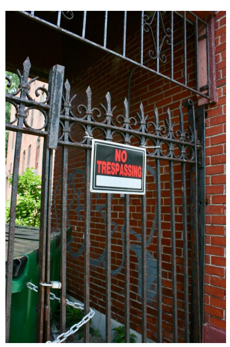
Figure 17. Detail of entrance gates at connector wall. May 2022.