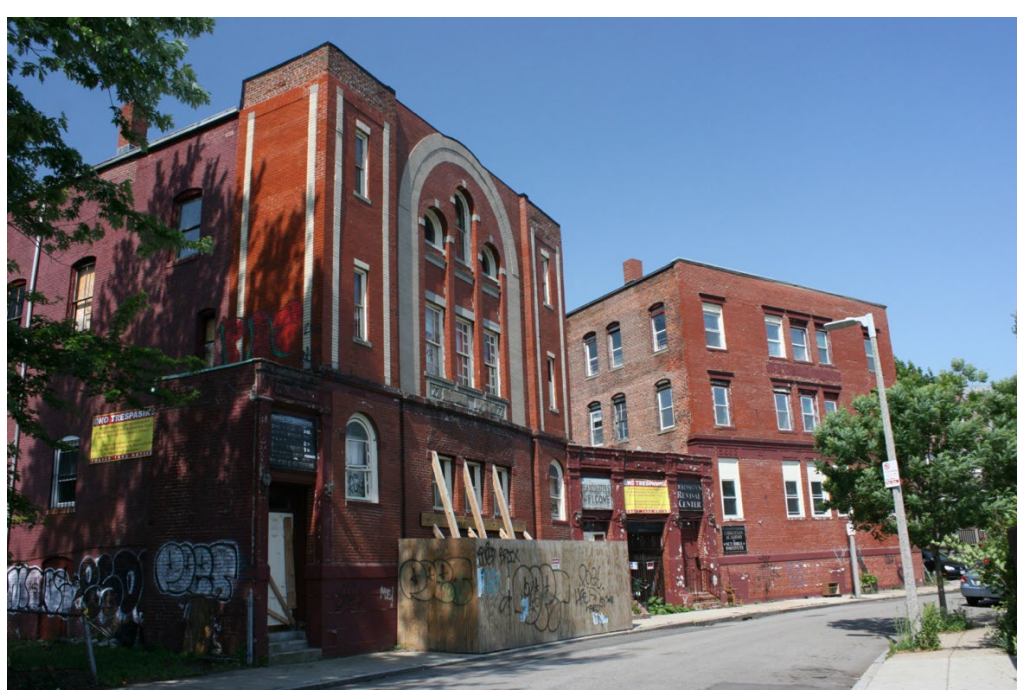
Figure 2 . Facades (northeast elevations) of Mt. Calvary Holy Church/Congregation Shara Tfilo Synagogue (L) and Roxbury Hebrew School (R), looking west. May 2022.