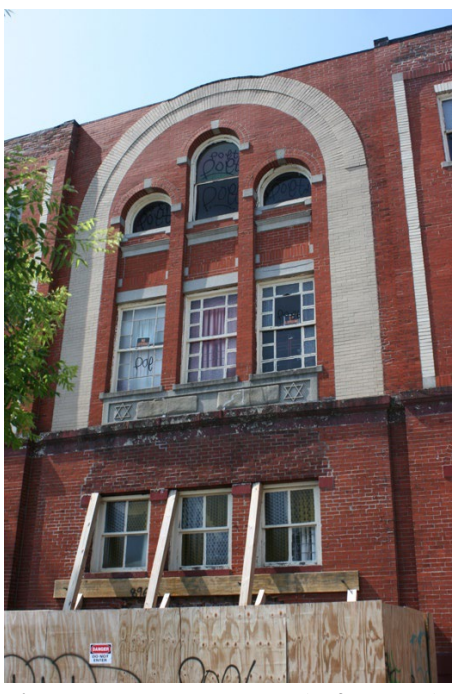
Figure 7 . Façade detail of Mt. Calvary Holy Church/Congregation Shara Tfilo Synagogue. May 2022.