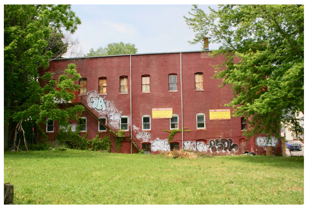
Figure 10. Southeast elevation of Mt. Calvary Holy Church/Congregation Shara Tfilo Synagogue, facing 17-19 Otisfield Street and Blue Hill Avenue. May 2022.