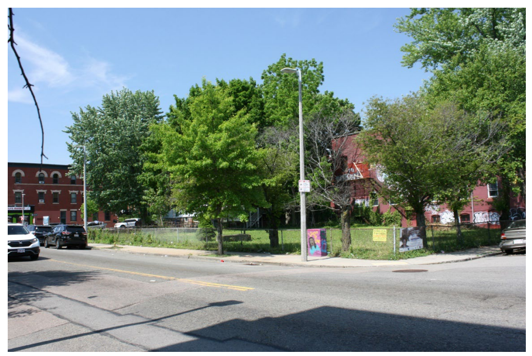
Figure 4 . View of open space at intersection of Blue Hill Ave. (L) and Otisfield Street (R), looking southwest. 17-19 Otisfield Street at right center. May 2022.