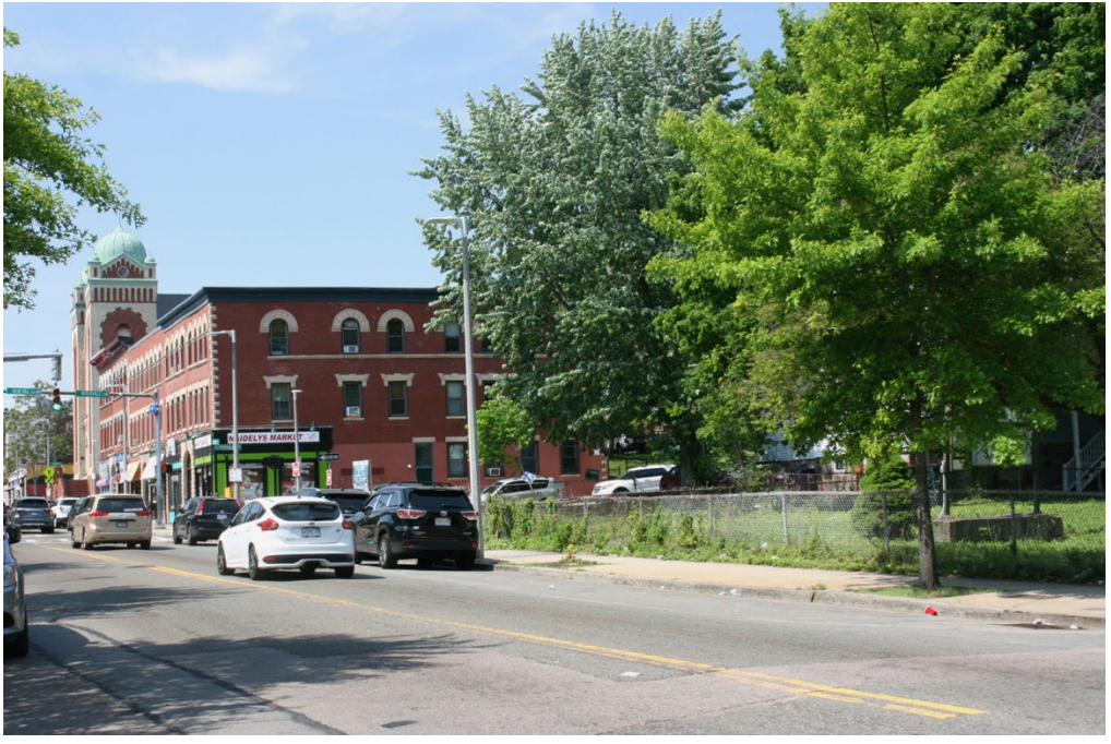
Figure 5 . Blue Hill Avenue, looking southwest from Otisfield Street. Open space at 17-19 Otisfield Street at right; Temple Adath Jeshurun at far left. May 2022.