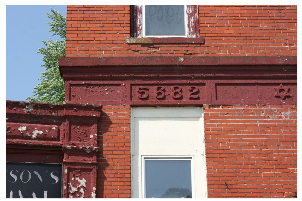
Figure 14. Façade detail of Roxbury Hebrew School. May 2022.