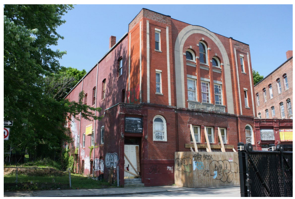
Figure 6 . Facade (northeast) and southeast elevation of Mt. Calvary Holy Church/Congregation Shara Tfilo Synagogue. May 2022.