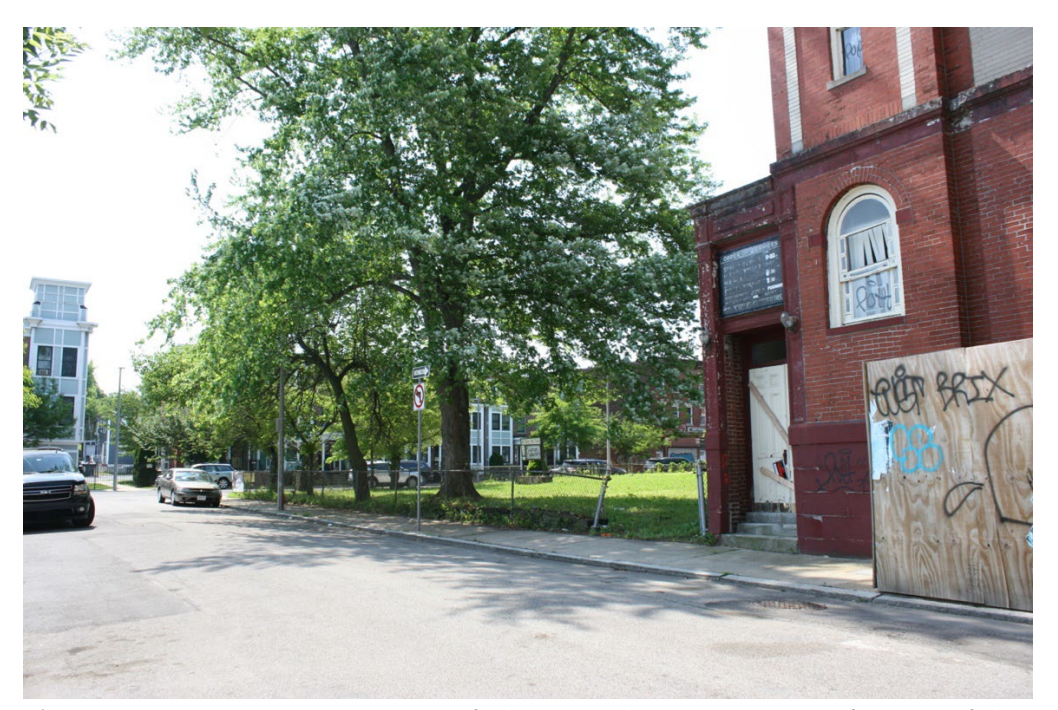
Figure 20 . Open space at 17-19 Otisfield Street, looking southeast from Otisfield Street. Mt. Calvary Holy Church / Congregation Shara Tfilo Synagogue at far right. May 2022.