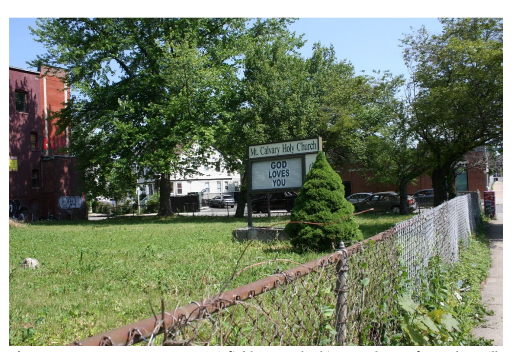
Figure 19. Open space at 17-19 Otisfield Street, looking northwest from Blue Hill Avenue. May 2022.