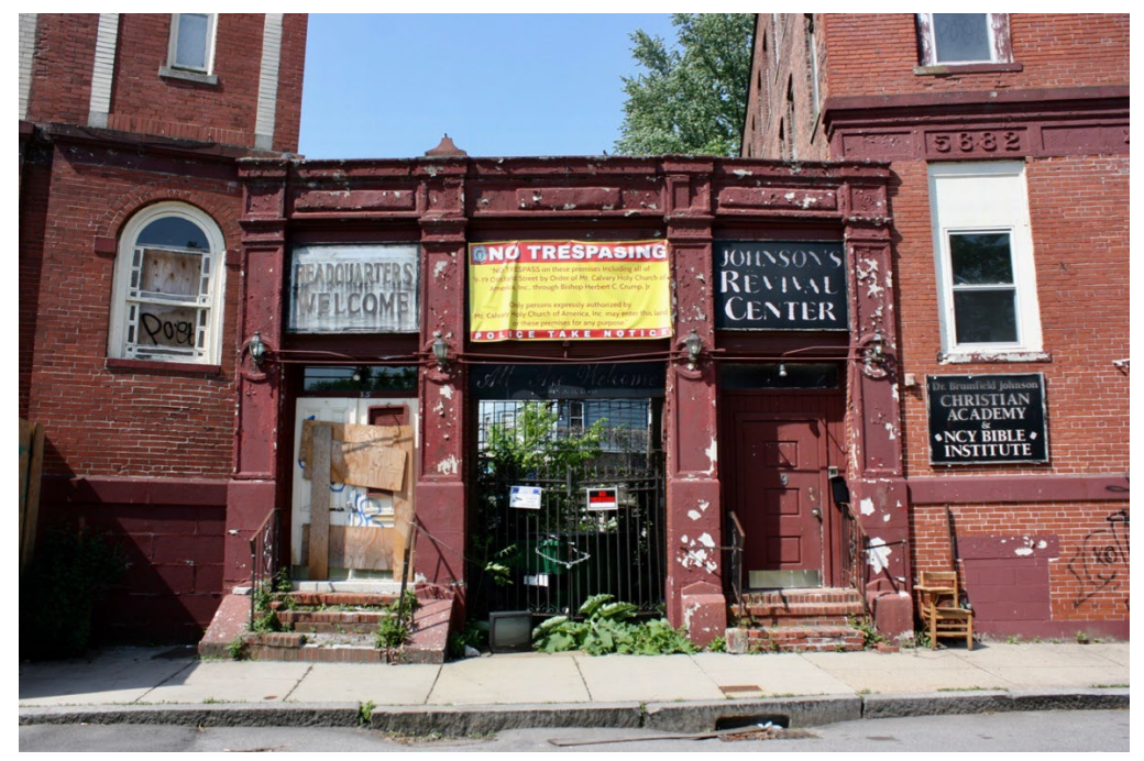
Figure 16 . Façade (northeast elevation) of connector wall between Mt. Calvary Holy Church/Congregation Shara Tfilo Synagogue (L) and Roxbury Hebrew School (R). May 2022.