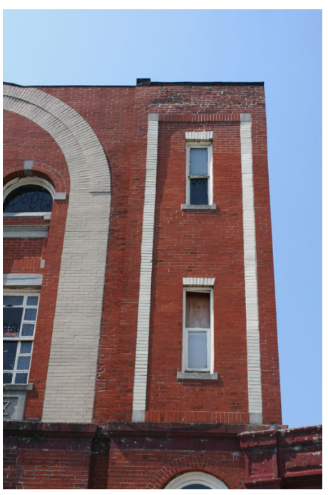
Figure 8 . Facade detail of Mt. Calvary Holy Church/Congregation Shara Tfilo Synagogue. May 2022.