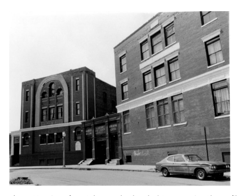
Figure 23. View of Mt. Calvary Holy Church / Congregation Shara Tfilo Campus, ca. 1970s, looking southeast.