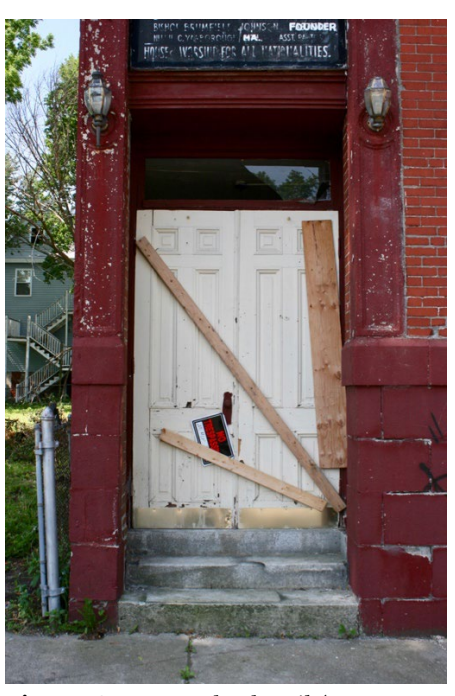
Figure 9 . Façade detail (east entrance) of Mt. Calvary Holy Church/Congregation Shara Tfilo Synagogue. May 2022.