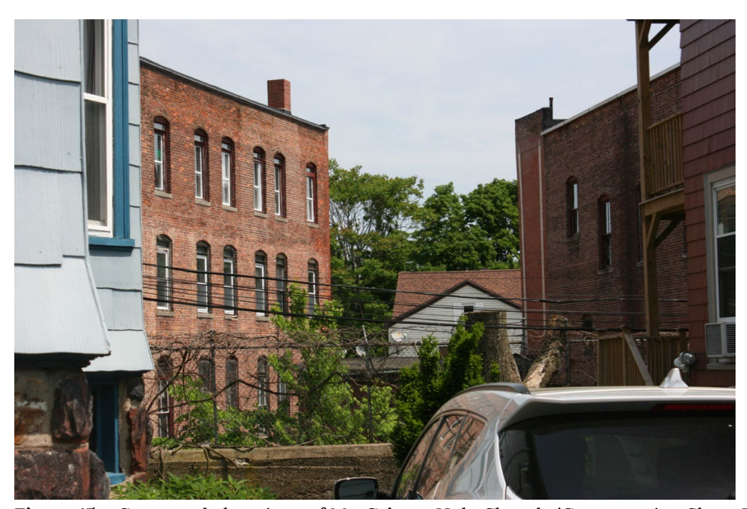
Figure 15 . Courtyard elevations of Mt. Calvary Holy Church/Congregation Shara Tfilo Synagogue (R) and Roxbury Hebrew School (L). May 2022.