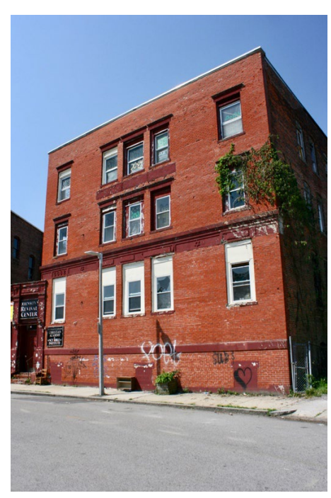
Figure 11. Facade (northeast elevation) of Roxbury Hebrew School. May 2022.