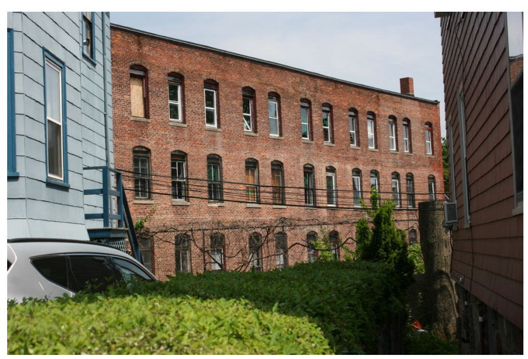
Figure 13. Southeast (courtyard) elevation of Roxbury Hebrew School. May 2022.