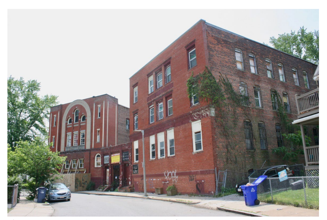
Figure 3 . Facades (northeast elevations) of Mt. Calvary Holy Church/Congregation Shara Tfilo Synagogue (L) and Roxbury Hebrew School (R), looking southeast. May 2022.