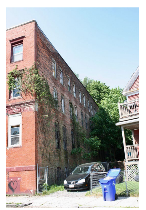
Figure 12. Northwest elevation of Roxbury Hebrew School. May 2022.