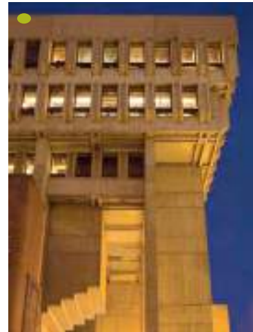
● Government Service Center, Boston; Paul Rudolph, 1971.