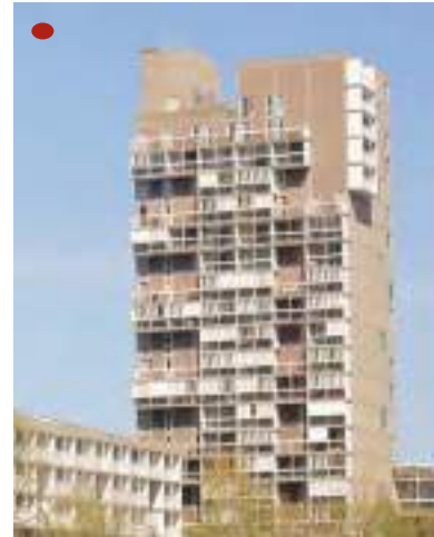
● Baker House, Massachusetts Institute of Technology, Cambridge; Alvar Aalto, 1948.