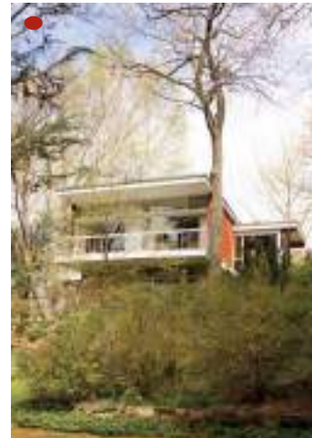
● Gropius House, Lincoln; Walter Gropius, 1938.